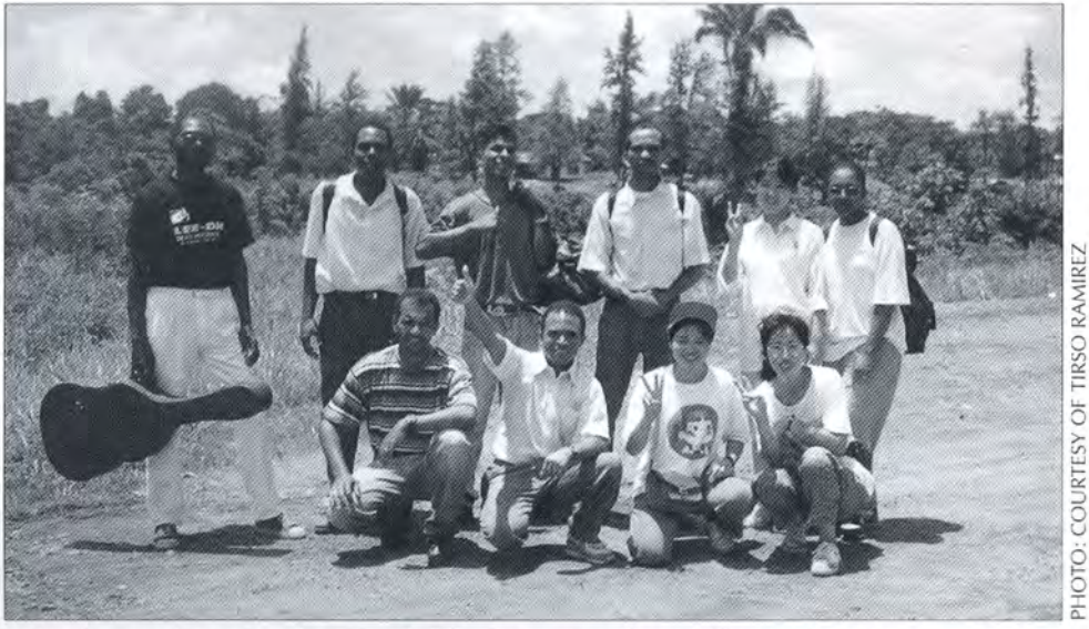
Members and guests who attended the "True Family and I" speech in Brokopondo.

We sent two members in advance to invite people for the speech, and they met a church leader who wanted to know