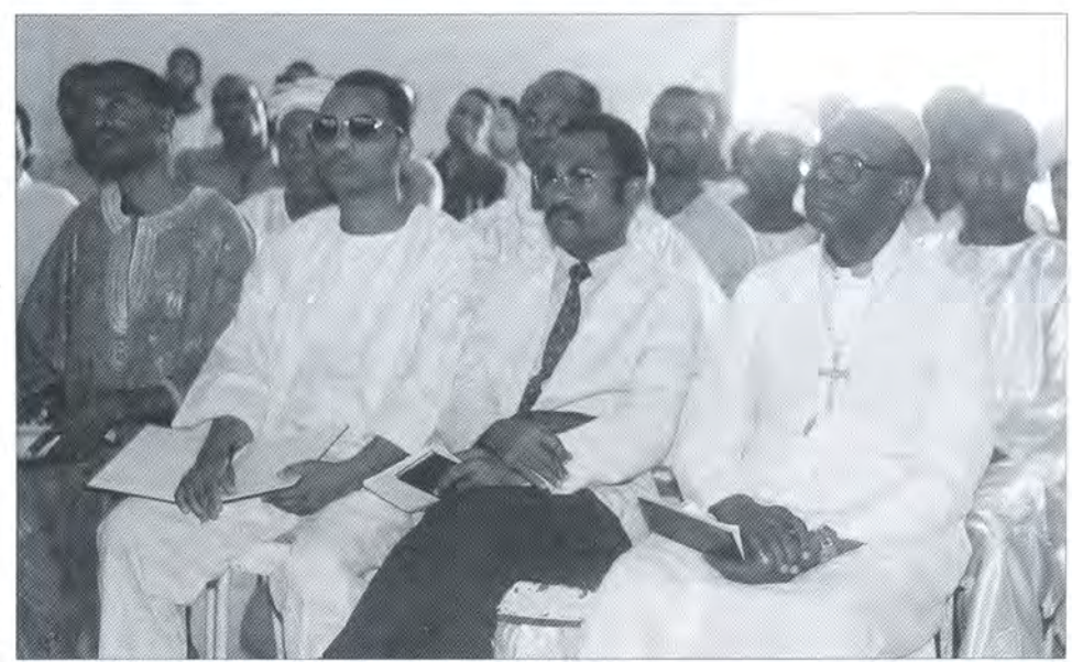
Blessing seminar narthinants

We continued the blessing ceremonies. Right now there are over 2,000 Christian pastors who are blessed. More, probably. We don't even have time to do our statistics, because every available member we have is either witnessing to new pastors or officiating at a blessing in a church. Literally people have no time to stop and type at a typewriter. We cannot take