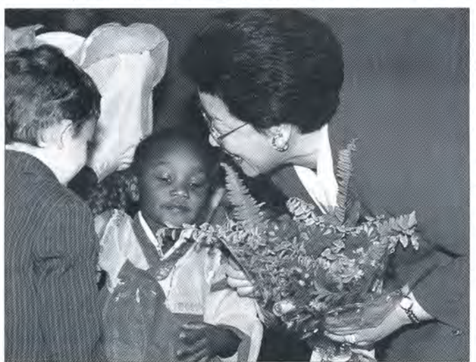
True Mother receives flowers after her speech. Nigeria, 1993.

Right before the blessings ended, we started organizing blessings on a new level. This was a community blessing. We would contact the traditional ruler of a village and witness to him and ask him to join the Family Federation for